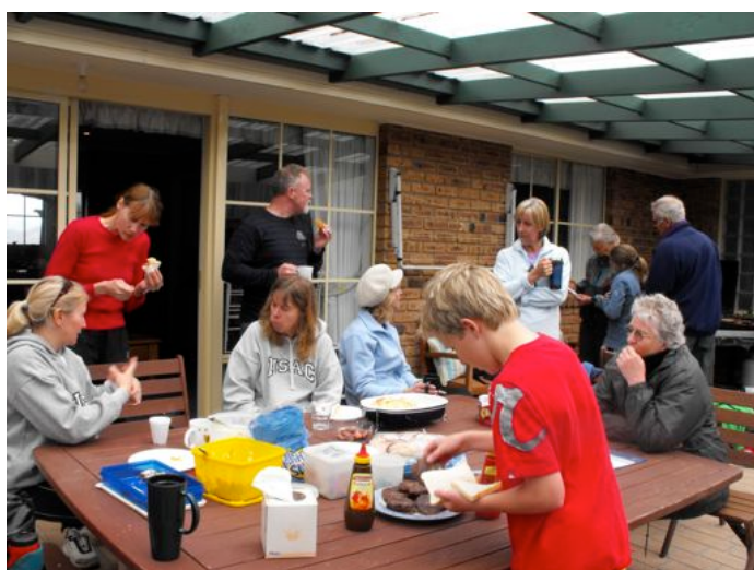
Getting stuck into the food