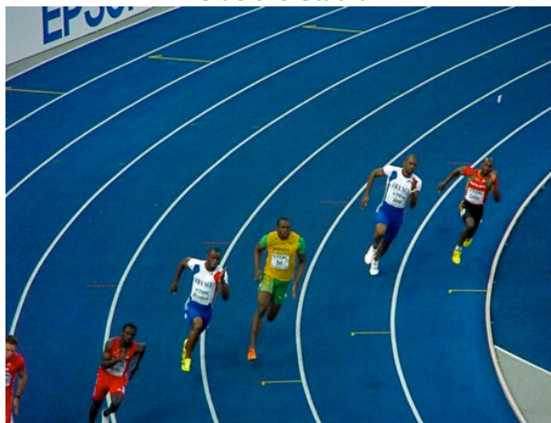
Ussain Bolts Heat of the 200m