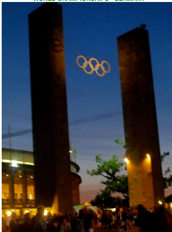
Entrance to the 1936 Olympic Stadium