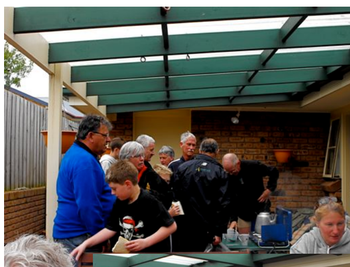
More talking than eating