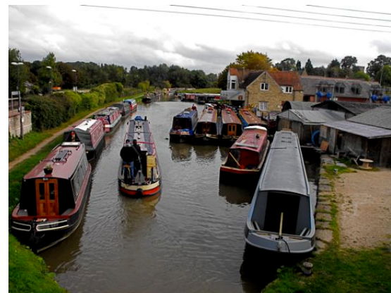
Lower Heyford - Oxfordshire