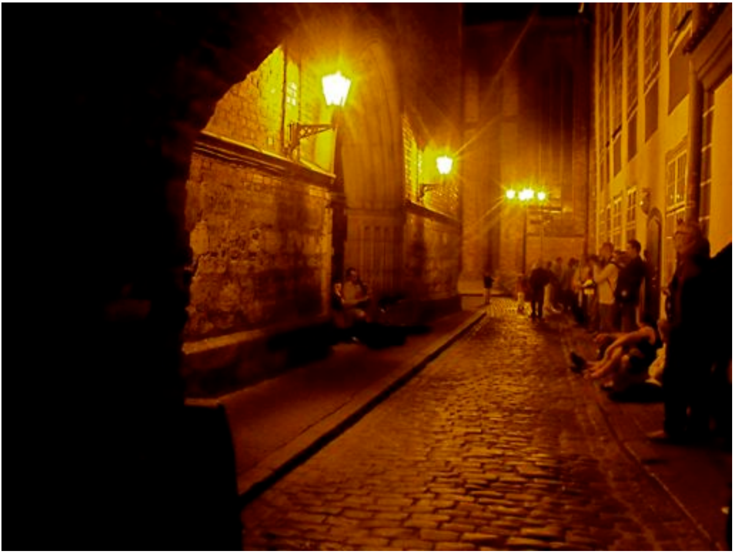
Riga Old Town - Latvia above & Railway Bridge below Latvia