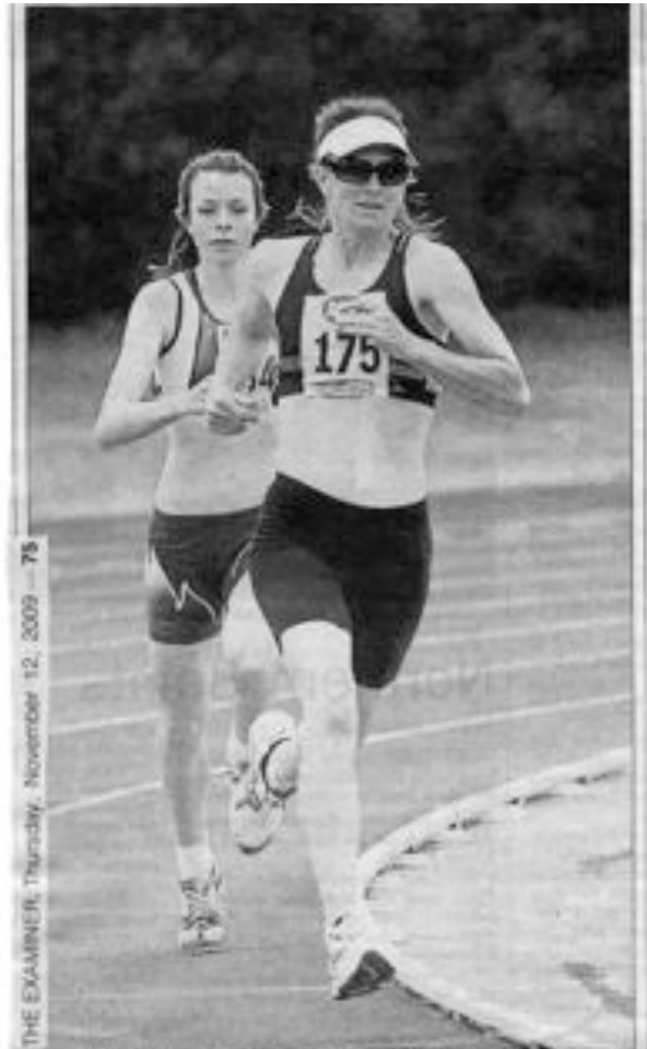
THE EXAMINER, Thursday, November 12, 2009 — 75