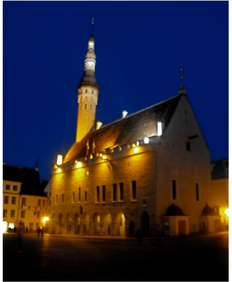
Tallinn Old Town - Estonia