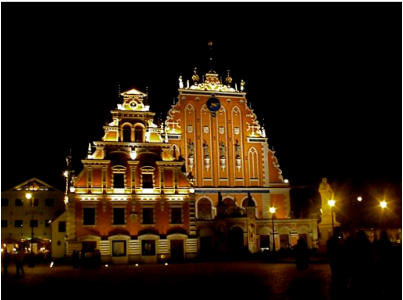
Riga Old Town - Latvia