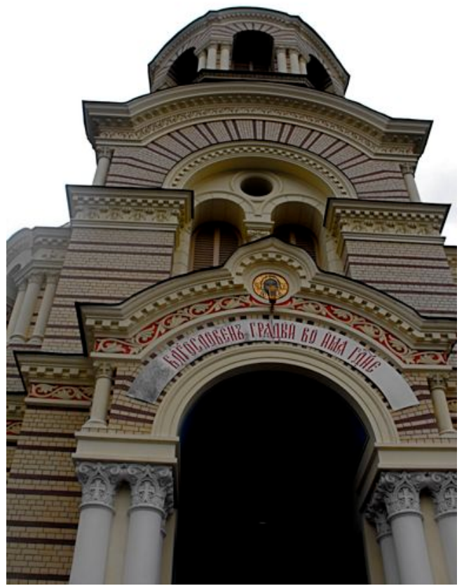
Riga - Latvia