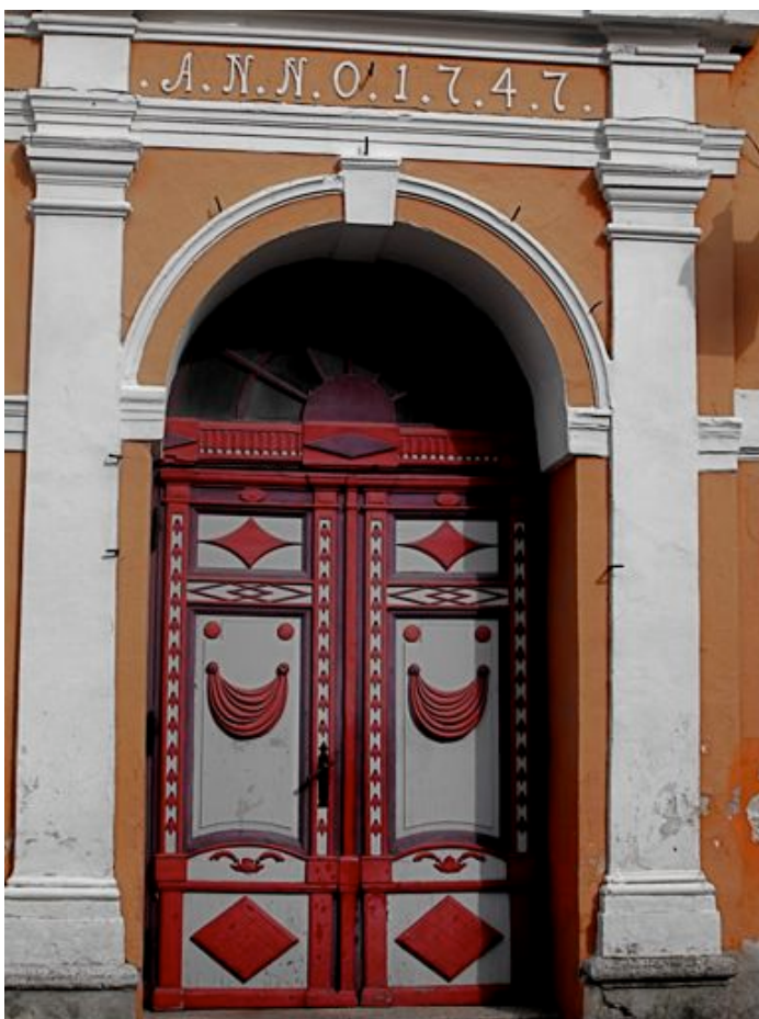
Tallinn Old Town - Estonia